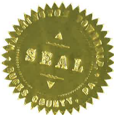
Exhibit A – Conservation Easement