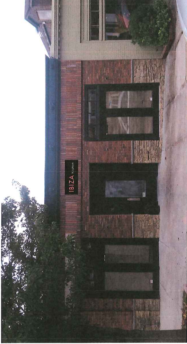
18"X48" routed out letters/black wood/red Ibiza/white kitchen